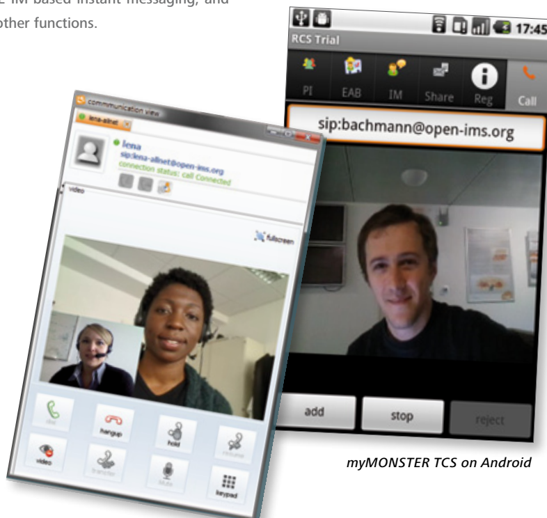
myMONSTER TCS on Android

The proliferation of mobile and fixed platforms, together with an increasing number of services to be accessed via different platforms means that an application written for one platform must be rewritten repeatedly for other platforms. This is an issue that increases time to market, reduces market size and hinders the uptake of services. To address this issue, Fraunhofer FOKUS has implemented an extensible plug-and-play framework – the Multimedia Open InterNet Services and Telecommunication EnviRonment (myMONSTER) that provides to developers a unified communication interface to bring together a suite of integrated applications from the Telecommunications, Web, and IPTV sectors on different target platforms.